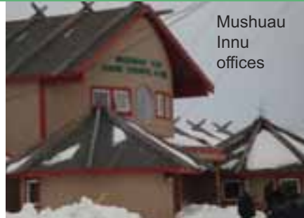
Mushuau Innu offices

In November 2007, the Mushuau Innu First Nation issued a request for proposals for a new co-manager to assist them with the management of their financial assets. The CESO Atlantic office staff responded to their request and CESO was named the successful candidate in January 2008.